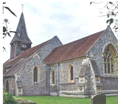
St Mary the Virgin