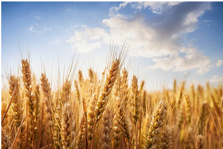
Summer turns to Autumn