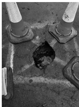
A "sinkhole" or a "void"?