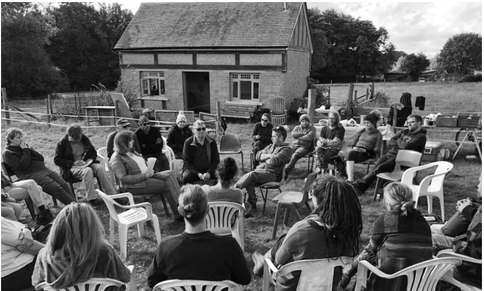
Hardwick Thinking Day

The Estate continues to work towards its upcoming transition into a community-led charity structure, moving away from private family ownership following the wishes of the Rose family. In February we held our third 'Thinking Together' day designed to help us build the skills we need to make this major change. At this event the newly formed Energy working group reported back on their work looking at options for community energy generation and energy efficiency. An energy efficiency survey has been designed and is now being completed, and the Estate's 30+ homes and businesses will be surveyed with a thermal imaging camera next winter to identify areas for improvement. Investigations into community generation of renewable energy, either via lots of individual on-home installations linked together, or perhaps a community solar farm/wind turbine.