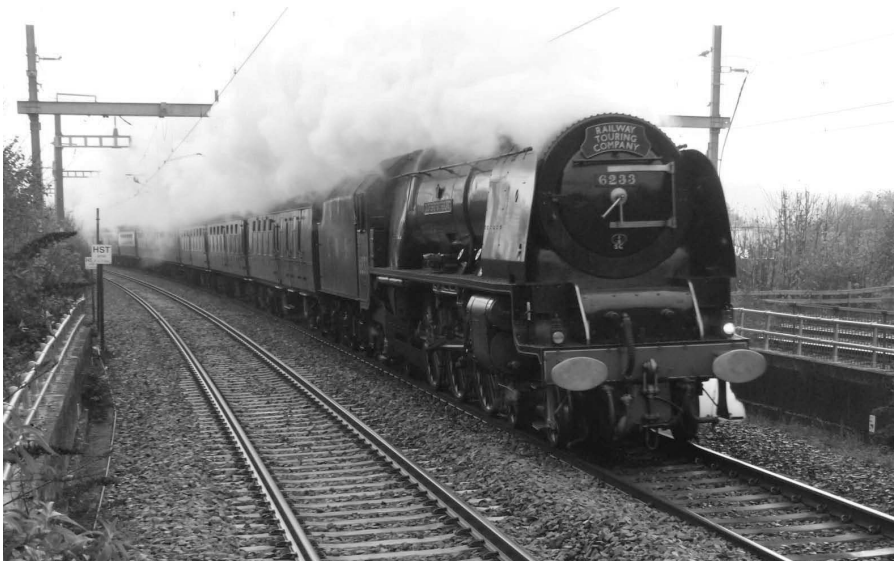
Duchess of Sutherland approaches Pangbourne Station 23/11/2021

For the LMS, this culminated in the “Princess Coronation” class, designed by their Chief Mechanical Engineer Sir William Stanier, built at Crewe, and introduced in 1938. 6233 “Duchess of Sutherland” was one of these, working until 1964 before being purchased for preservation.