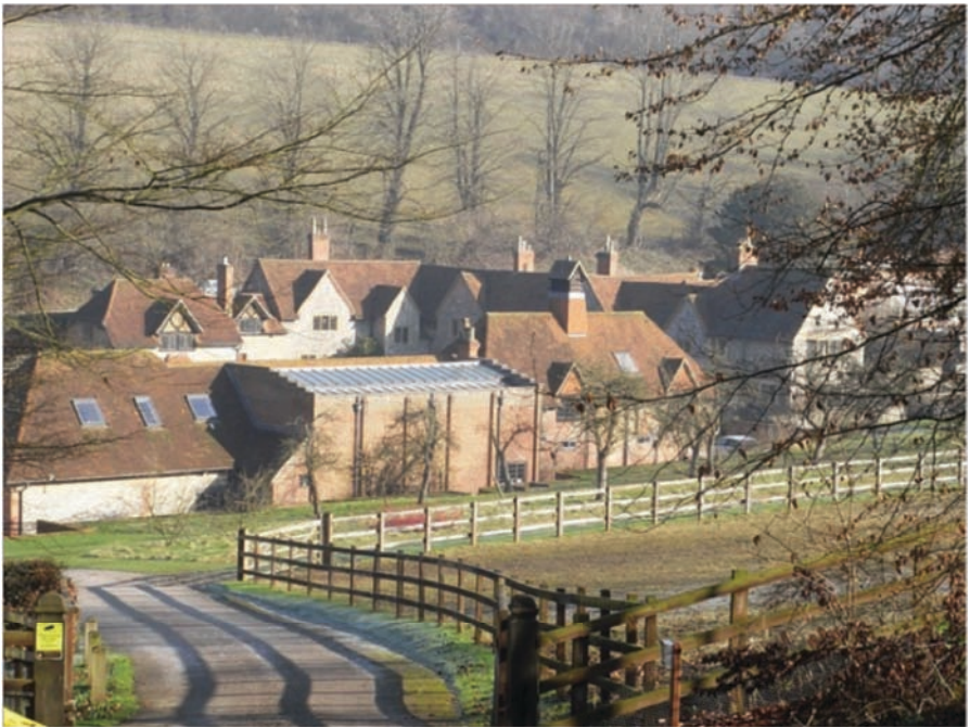
Elvendon Priory is the destination for the Spring Walk on Sunday, 20th March