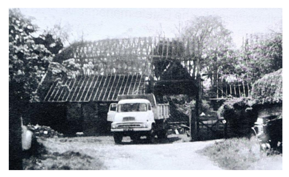
The barn after the fire

There is more on the barn, including local suspicions about its demise, on pages 120-125 of Relics & Monuments by Peter Hawley, 2017, obtainable from the Whitchurch History Society (contact details here).