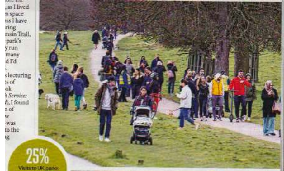
BIN THERE Warm weather in March brought large crowds of sunbathers to Cannon Hill Park in Birmingham, top, and Sefton Park, Liverpool — and many of them left their litter behind

...as I lived n space ss I have ring msin Trail, park's y run many d I'd i. s lecturing ts of ok h Service: d, I found n of w was to the g