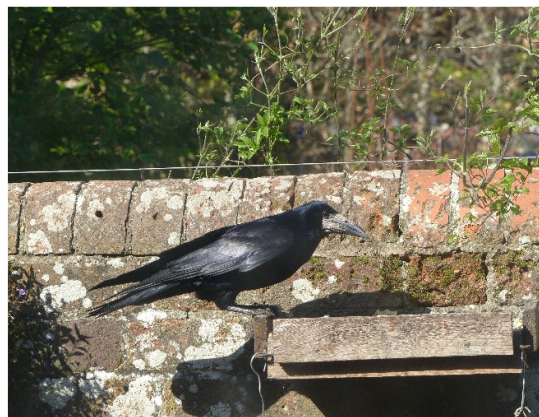
Is this a rook or a crow – you decide!!