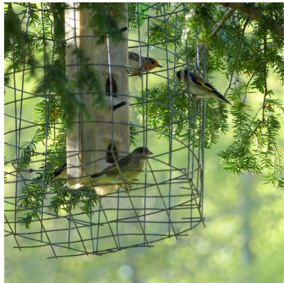
Robin, goldfinch & greenfinch sharing the seeds