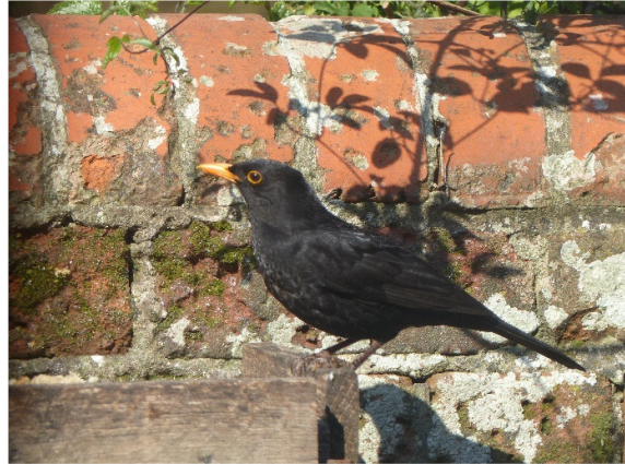
Female and male blackbirds (left and above)