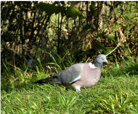
The ubiquitous wood pigeon (above) - do you love them or hate them?