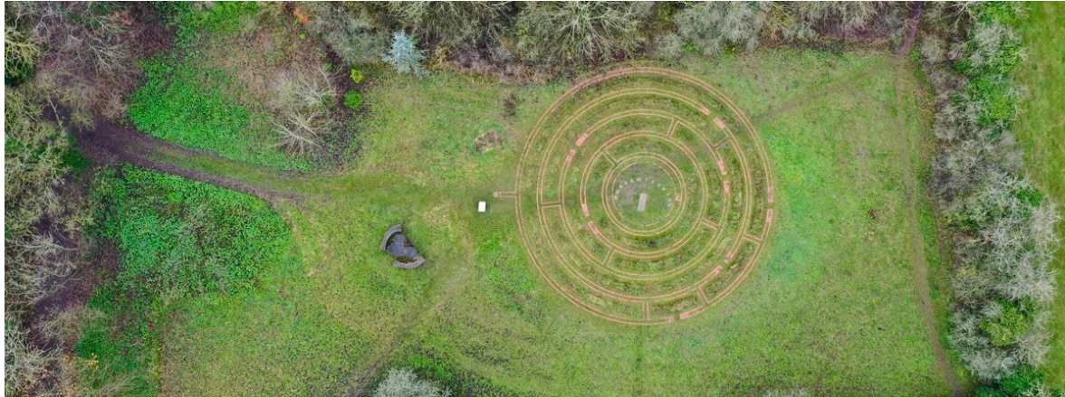
December 2018