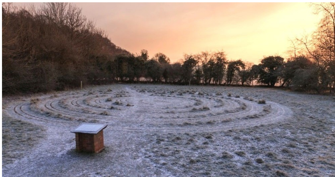
Frozen by the Beast from the East, 2018

See the next three pages for photographs of the Maze from 2004 to 2018 and of some recent events.