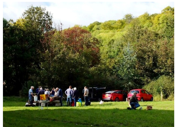
Apple pressing 2019