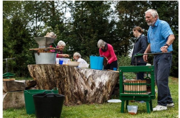
Apple pressing 2018